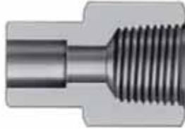
Tube socket weld to female NPT connector