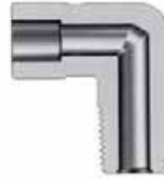
Tube socket weld to male NPT elbow