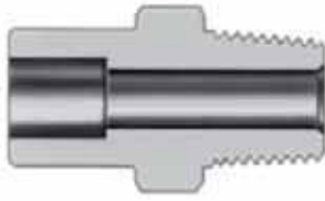
Tube socket weld to male NPT connector