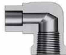
Tube socket weld to female NPT elbow